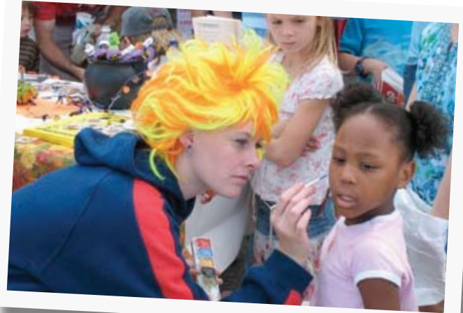
Free face painting at Housatonic Youth Service Bureau's table on Halloween Safety.

The Foundation for Community Health has invested in all of these areas over the past few years and is committed to continuing its efforts in collaboration with all parties involved, particularly local providers of mental health and substance abuse services, in order to ensure a full spectrum of effective behavioral health services in our communities.