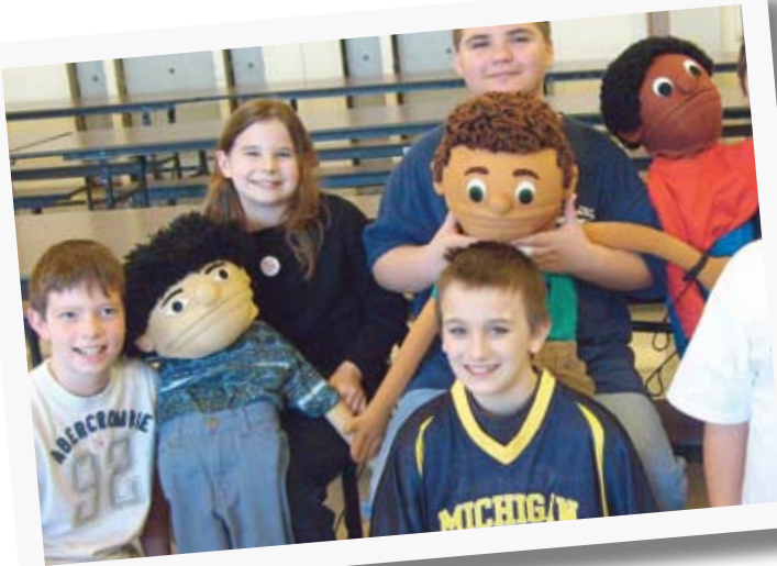
Kids on the Block

“You taught me the greatest lesson. I learned that being a friend to others is the greatest gift I have ever gotten . . . I also learned that the “I Statement” teaches others how to be respectful . . . Star Person taught me that I can talk to lots of adults and they’ll understand what I am talking about.”