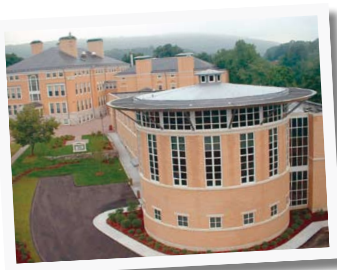
Northwestern CT Community College (NCCC), Winsted, CT

Mindful of the fact that circumstances in our service area are always evolving, the Foundation for Community Health has remained attentive and receptive to new ideas and opportunities that do not meet the guidelines of the current Program Priority Areas, but that will nonetheless help our community to address and improve problematic or challenging conditions and to stay abreast of emerging issues. Consequently, the Foundation maintains some funds that are available for responding to such issues or requests. These funds can be used, for example, as a response to an emergency or unexpected event, a unique idea or pilot project, or a request to join a fellow funding partner in a collaborative effort to benefit our community.