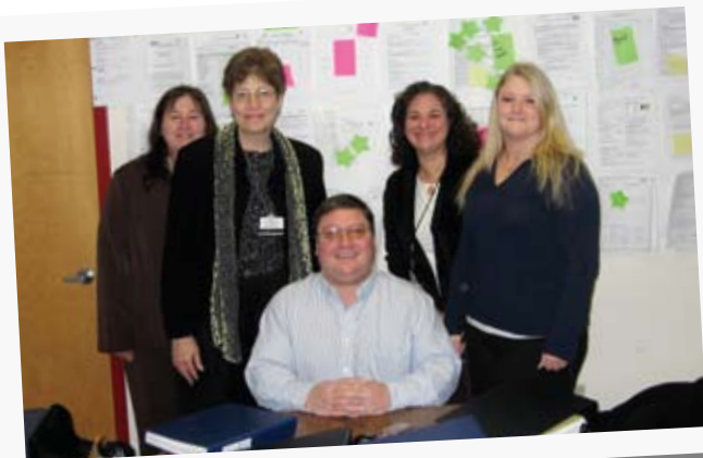
Paper Work Load & Flow Team at Astor Home for Children working to reduce time completing paperwork and increase time with clients.

To ensure that area clients will be able to maintain services during a time of transition in the administration.