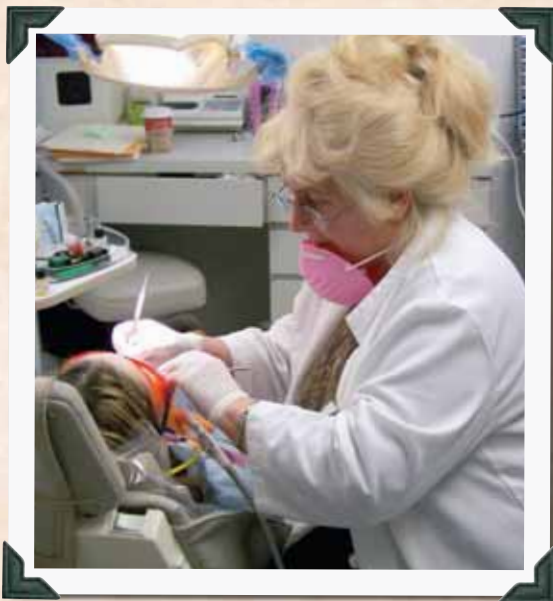
Taconic Hills School District Oral Health, NY