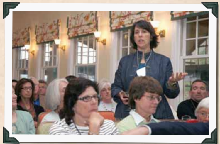
Non-Profit Learning Program, NY/CT