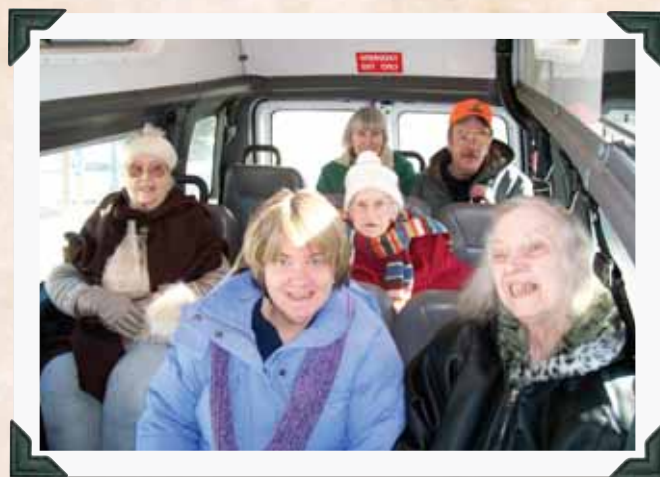
Transportation, Geer Adult Day Center, CT