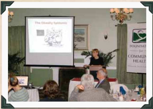
Medical Education Event, NY/CT