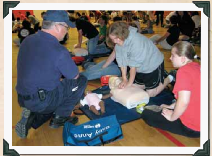
Training by EMS Institute, NY/CT