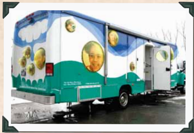
Dental Van, Hudson River Healthcare, NY