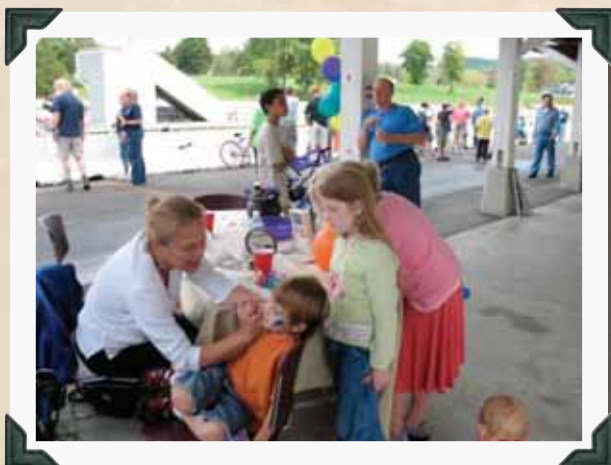
Housatonic Youth Service Bureau, CT