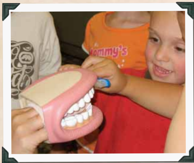
School-based Preventive Oral Health, CT