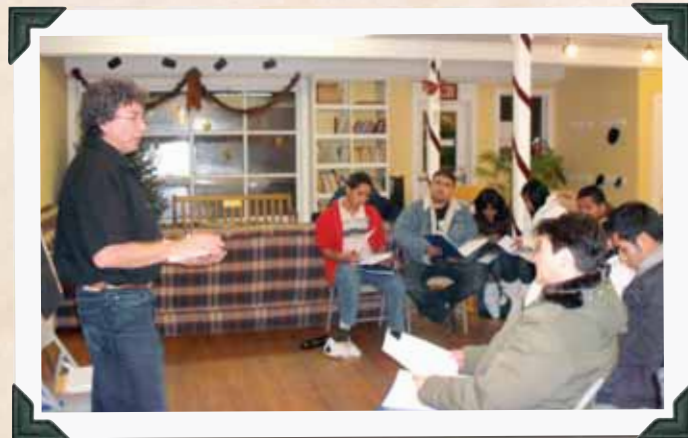
Somos Salud, NY

155 Sharon Valley Road Sharon, CT 06069 800.695.7210 • 860.364.5157 fax: 860.364.6097 www.fchealth.org