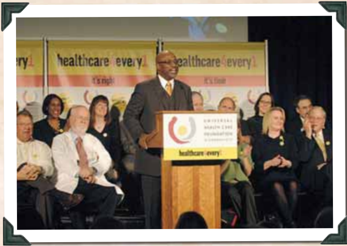
Healthcare4every1 Campaign, CT