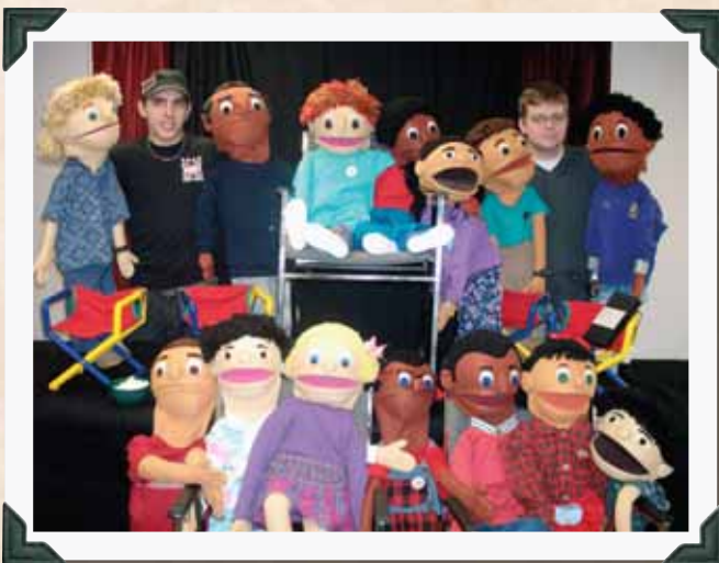
Kids on the Block, NY